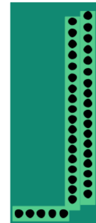
Port for DDCSV3.1